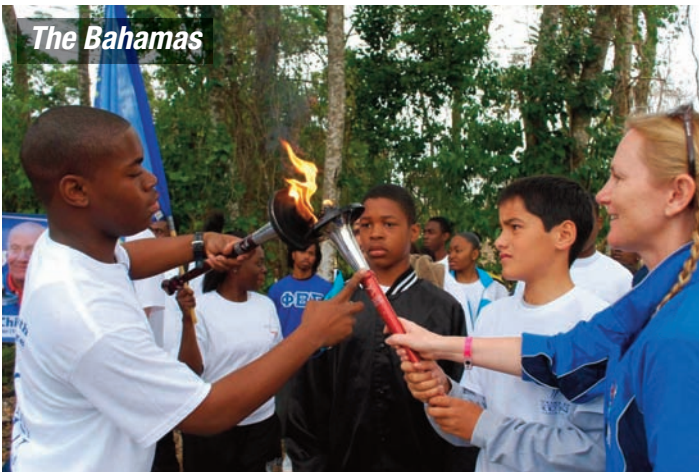
A police cadet lights a Westminister School student's torch as part of a community relay in New Providence, The Bahamas.