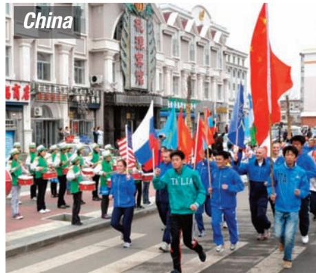
The international team runs with local athletes through the streets of Zhaltuntun, China.