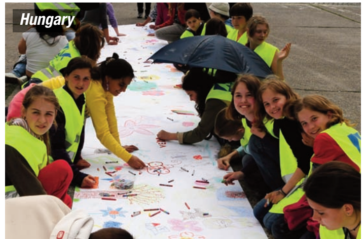
In Hungary over 5,000 children gathered in a Budapest central square to create art focused on peace and harmony.

This year the World Harmony Run will visit over 100 nations on all seven continents - including Antarctica. An undertaking of this magnitude takes a huge team and we thank everyone involved for their cooperation in bringing this event to fruition.