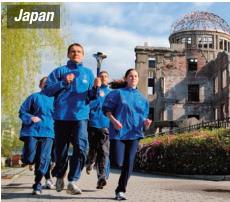
Our 10,000 mile Asian journey began at Hiroshima's sacred Peace Memorial Park where we lit the torch from the eternal flame.