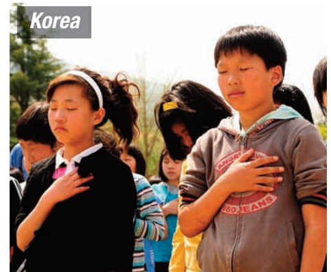
At every ceremony we encourage people to be silent and feel the peace we have in our hearts.