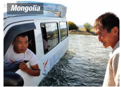
There are always challenges on the road to harmony, although this one was deeper than usual.