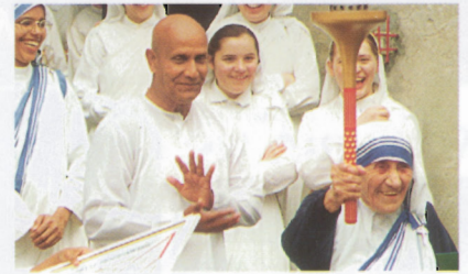
Mother Teresa and Sri Chinmoy celebrate the spirit of harmony.