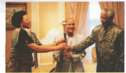
Nelson Mandela, former President of South Africa, and his wife Mama Graça Machel with Sri Chinmoy.