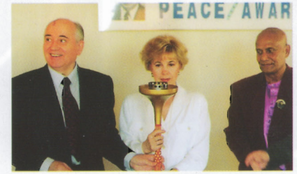
Former Soviet President Mikhail Gorbachev holds the torch with his wife Raisa Maximovna as Sri Chinmoy looks on.