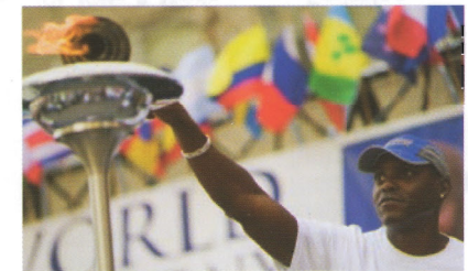
Nine-time Olympic gold medalist Carl Lewis speaks about the goals of the Run.