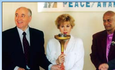
Former Soviet President Mikhail Gorbachev holds the torch with Raisa Maximovna as Sri Chinmoy looks on.