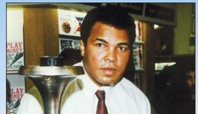
Muhammad Ali, world renowned boxing great, reflects on harmony.