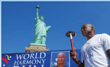
Nine-time Olympic gold medalist Carl Lewis lights the torch at the Statue of Liberty.