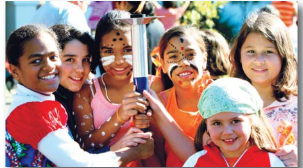
Children – Tomorrow's World Leaders: The World Harmony Run brings the message of peace and friendship to students in thousands of schools around the world.