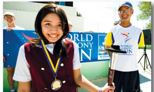
You and your community are invited to nominate recipients for the Torch-Bearer Award. This girl was chosen by her classmates.

The World Harmony Run offers its Torch-Bearer Award to recognize and honor those who have made significant contributions of service to their community -- whether they are Presidents or schoolchildren.