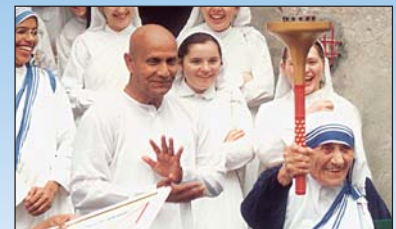
Mother Teresa and Sri Chinmoy celebrate the spirit of harmony.