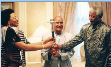
Nelson Mandela, former President of South Africa, and his wife Mama Graça Machel, with Sri Chinmoy.