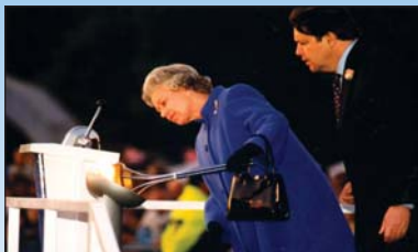
Queen Elizabeth II lights a beacon to celebrate the 50th Anniversary of VE Day.