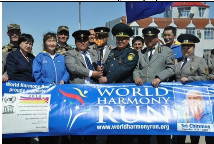
Sharing the Torch of Harmony and Peace in Mongolia with 2010 banner at the starting point of 2,600 kilometer journey