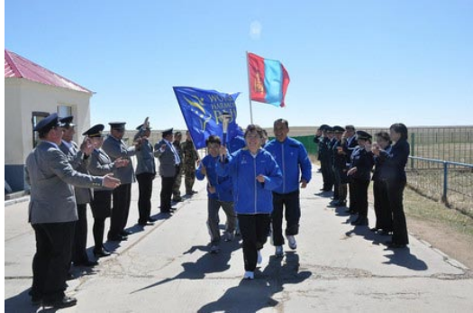
Border chiefs and staff in lines warmly welcome international team of runners entering country.

Report of 2010 May 15 see: - http://www.worldharmonyrun.org/mongolia/news/2010/0515