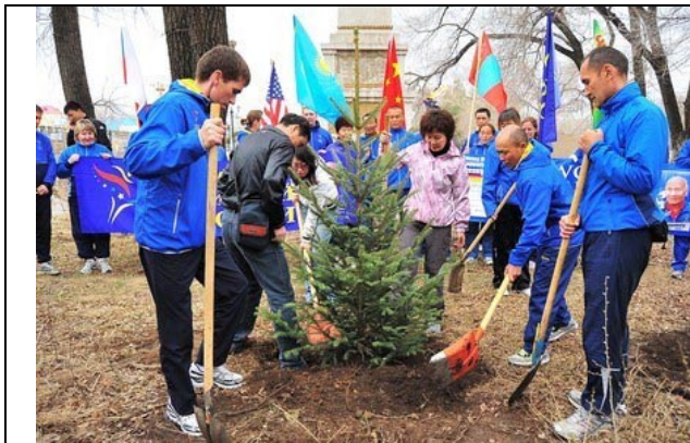
Representatives of five countries planting a peace tree.

For full report of day 2010 May 09 see: http://www.worldharmonyrun.org/china/news/2010/0509a