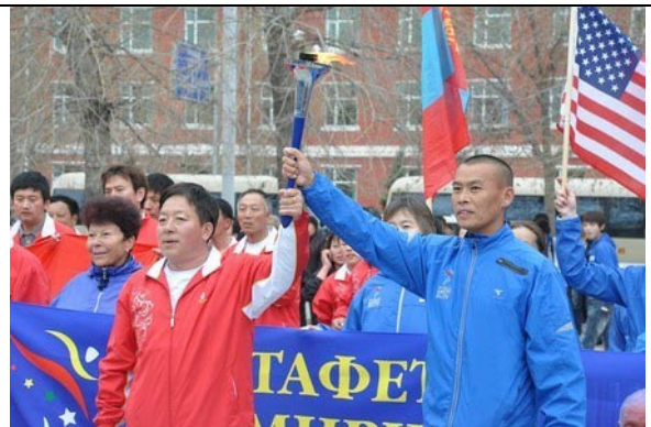
National and International Team Share the Torch.