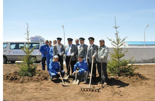
Four peace trees were planted by border staff and Harmony Run members.