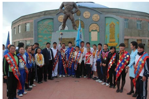
Хөвсгөл аймгийн Мөрөн хот