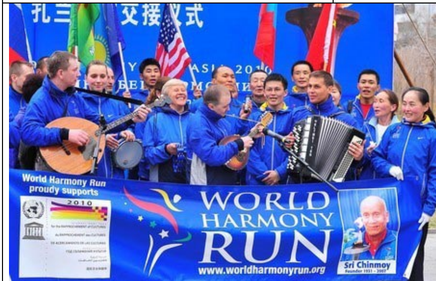
International musicians from the running team perform for audience with 2010 IYRC on Banner.