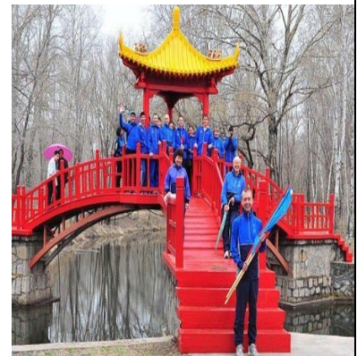
Team on an ancient 'triadic' bridge.