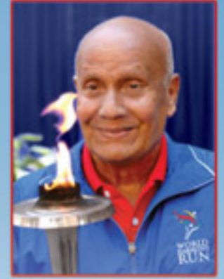
Sri Chinmoy Founder 1931-2007