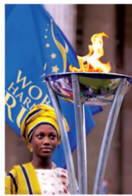
The flame brings hope to people of all nations.

The World Harmony Run is a global torch relay that symbolizes humanity's universal aspiration for a more harmonious world.