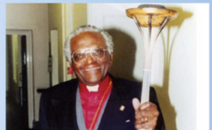
Archbishop Desmond Tutu shows his support for the World Harmony Run.