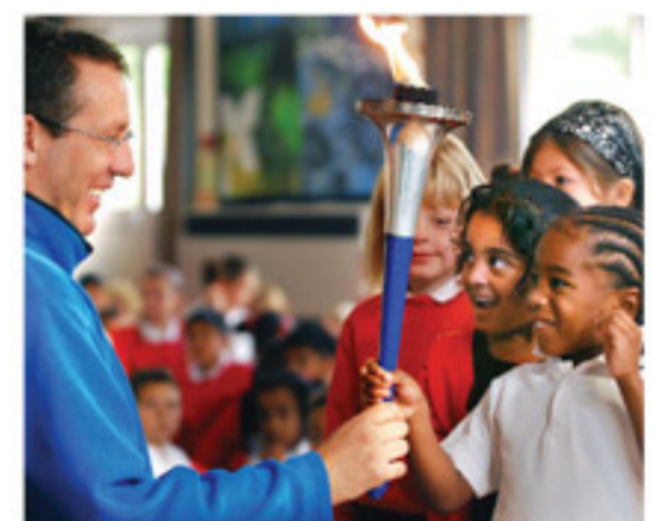
Everyone gets a chance to hold the torch.