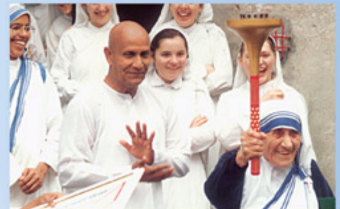
Mother Teresa and Sri Chinmoy celebrate the spirit of harmony.