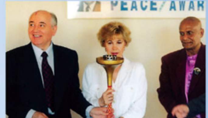
Former Soviet President Mikhail Gorbachev holds the torch with his wife Raisa Maximovna as Sri Chinmoy looks on.