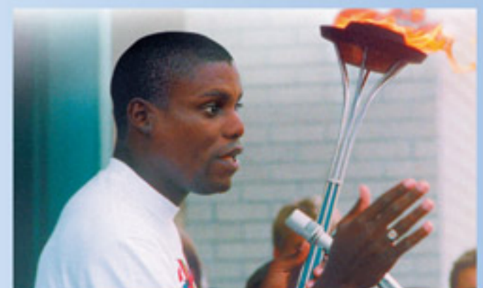
Nine-time Olympic gold medalist Carl Lewis speaks about the goals of the Run.