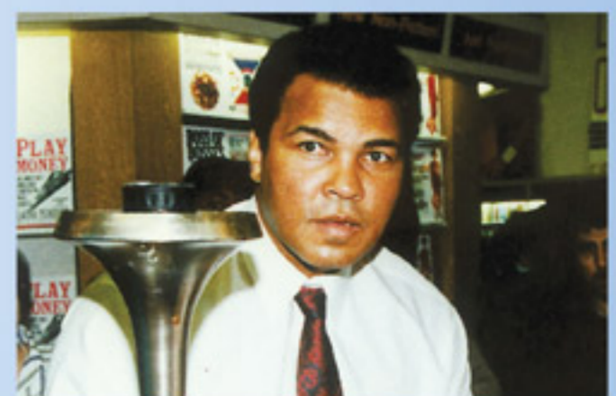
Muhammad Ali, world renowned boxing great, reflects on harmony.

United in Diversity: We are all part of the same world family.