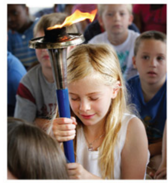
Making a wish for world peace.

Everyone can participate: athletes and non-athletes, young and old alike. Carry the torch a few steps, a few blocks or a few miles, or join in one of the thousands of welcoming ceremonies along the route. All it takes is your commitment to take a step for world harmony.