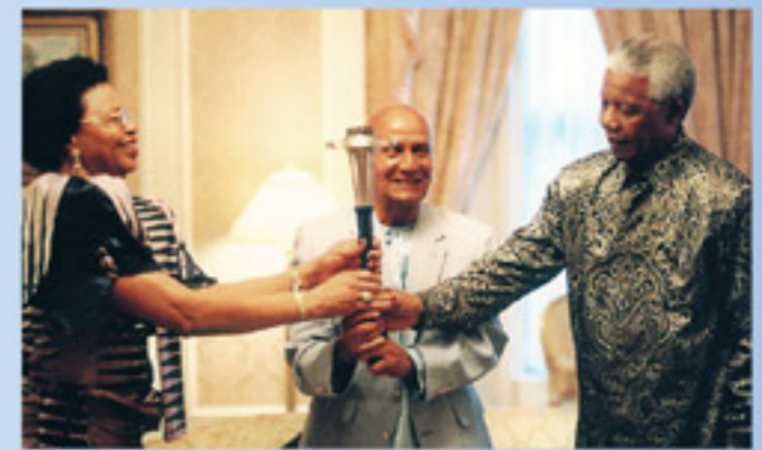
Nelson Mandela, former President of South Africa, and his wife Mama Graça Machel with Sri Chinmoy.

An athlete, philosopher, artist, musician and poet, Sri Chinmoy dedicated his life to advancing the ideals of world friendship and oneness.