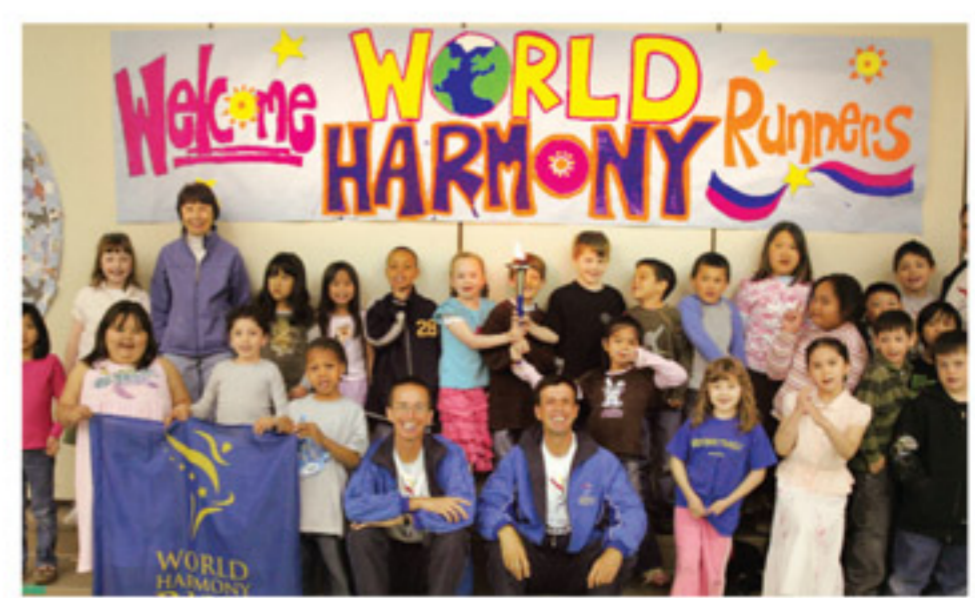
Through classroom presentations World Harmony Runners from various nationalities share valuable lessons in friendship, cultural diversity and peace building.