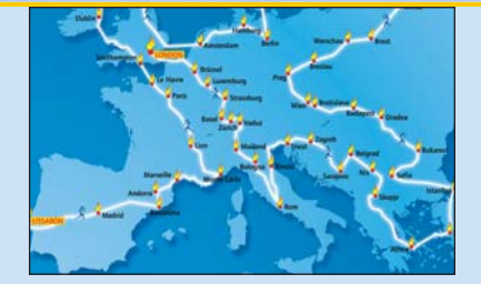
European Relay visits 42 countries and takes place each day of the year in 1999.