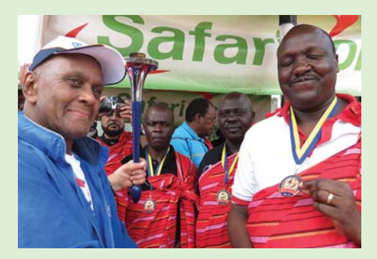
The Torch-Bearer Award program recognizes individual efforts by honoring peace-building pioneers from all age groups.