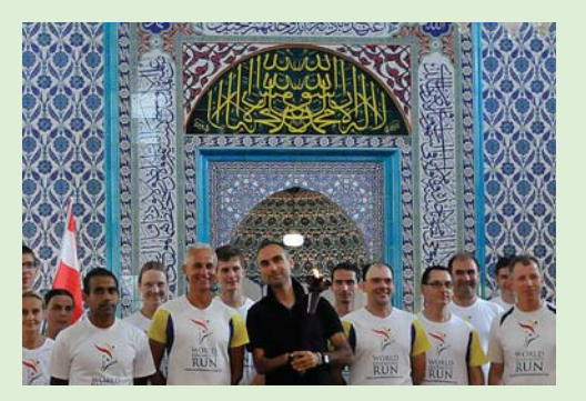
The World Harmony Run has been welcomed in churches, mosques, synagogues, temples and other places of worship. Through the World Harmony Run a culture of peace, and a feeling of universal oneness is being fostered.