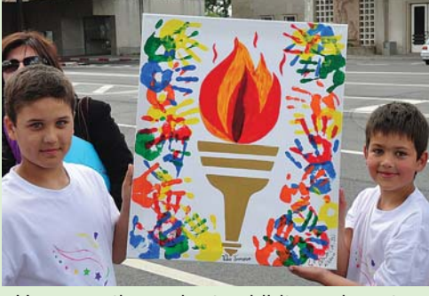
Harmony-themed art exhibits and poetry events are wonderful occasions to bring people together to express universal aspirations.