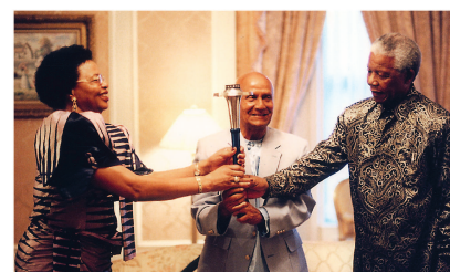
Nelson Mandela, former President of South Africa , and his wife Mama Graça Machel with Sri Chinmoy.