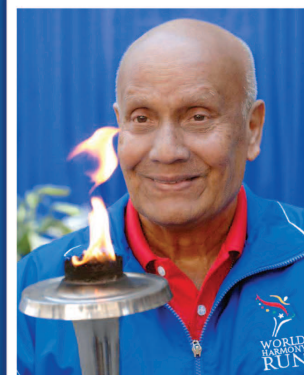
Sri Chinmoy Founder (1931 - 2007)

International Year of Youth: Dialogue and Mutual Understanding August 2010 - August 2011