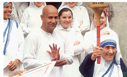
Mother Teresa and Sri Chinmoy celebrate the spirit of harmony.