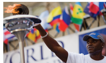
Nine-time Olympic gold medalist Carl Lewis lights the torch at the global launch in New York.